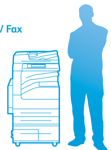
WorkCentre 5335 with High-Capacity Tandem Tray